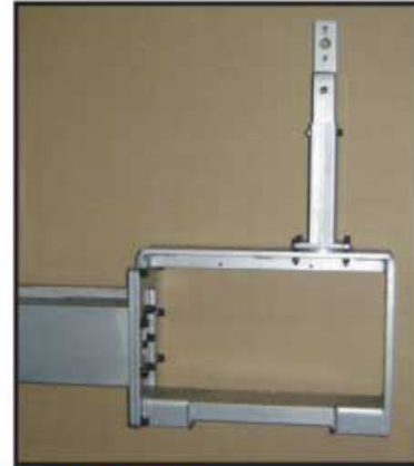
PROFAX NO: WM-SA Optional for mounting sub-arc package.