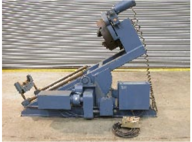
LATHE BEFORE PHOTO